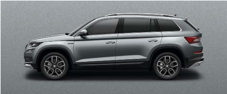
BUSINESS GREY METALLIC