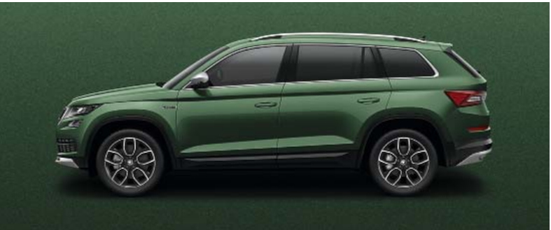
EMERALD GREEN METALLIC