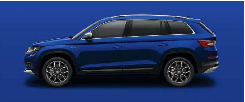
ENERGY BLUE UNI