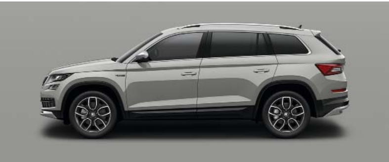
STEEL GREY UNI