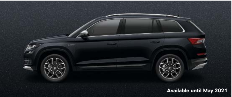
CRYSTAL BLACK METALLIC