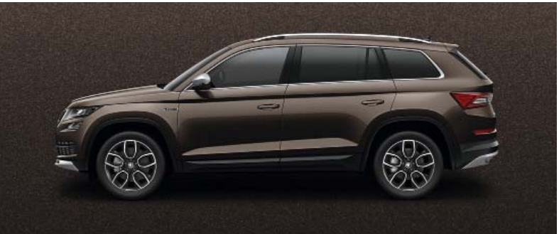
MAGNETIC BROWN METALLIC