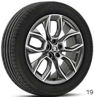
19" Crater anthracite alloy wheels are optional.