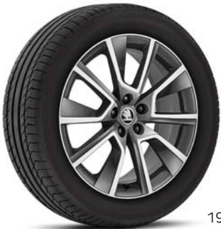
19" Braga anthracite alloy wheels come as standard.