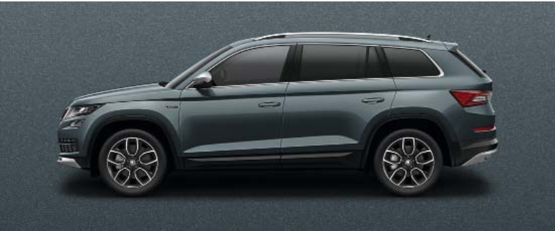
QUARTZ GREY METALLIC