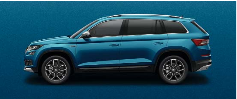
LAVA BLUE METALLIC