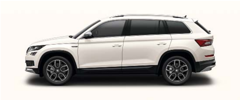
CANDY WHITE UNI