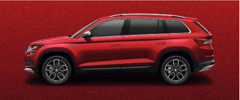
VELVET RED METALLIC