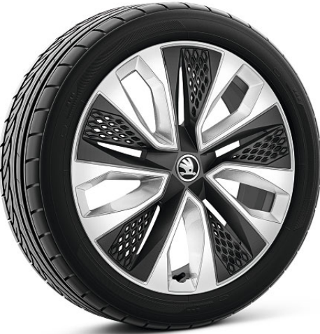
19" PROCYON alloy wheels with black matt Aero covers