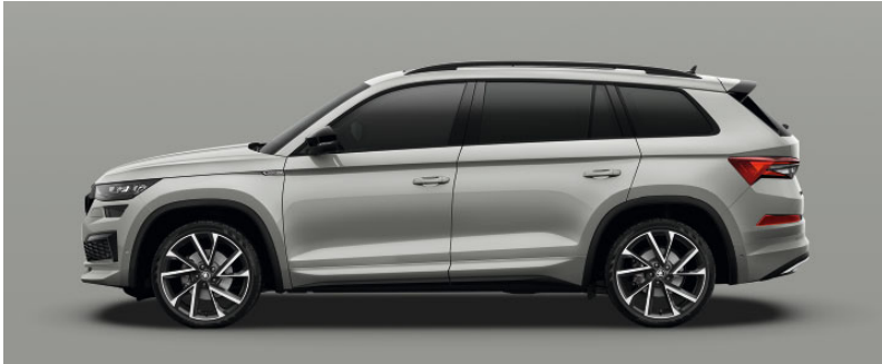
STEEL GREY UNI