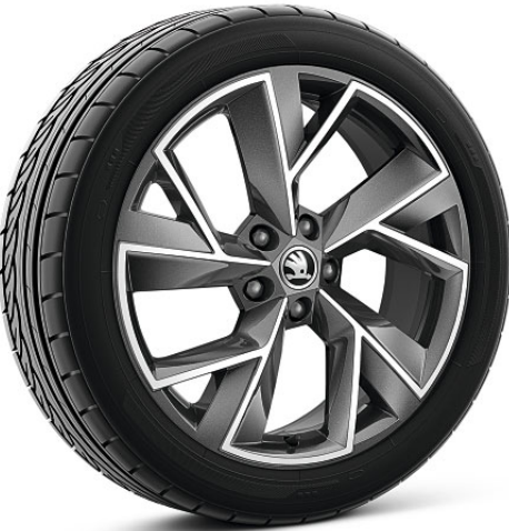
19" TRIGLAV anthracite alloy wheels