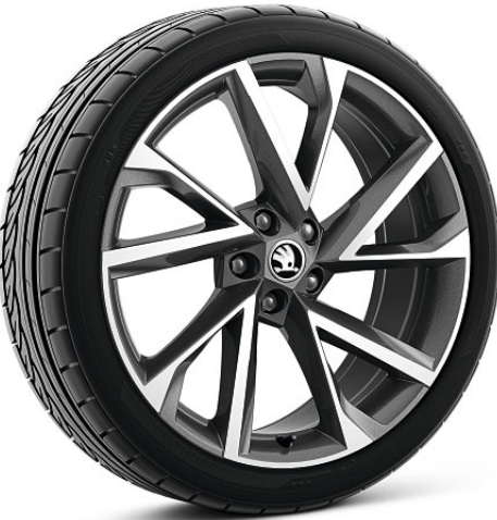
20" VEGA anthracite alloy wheels