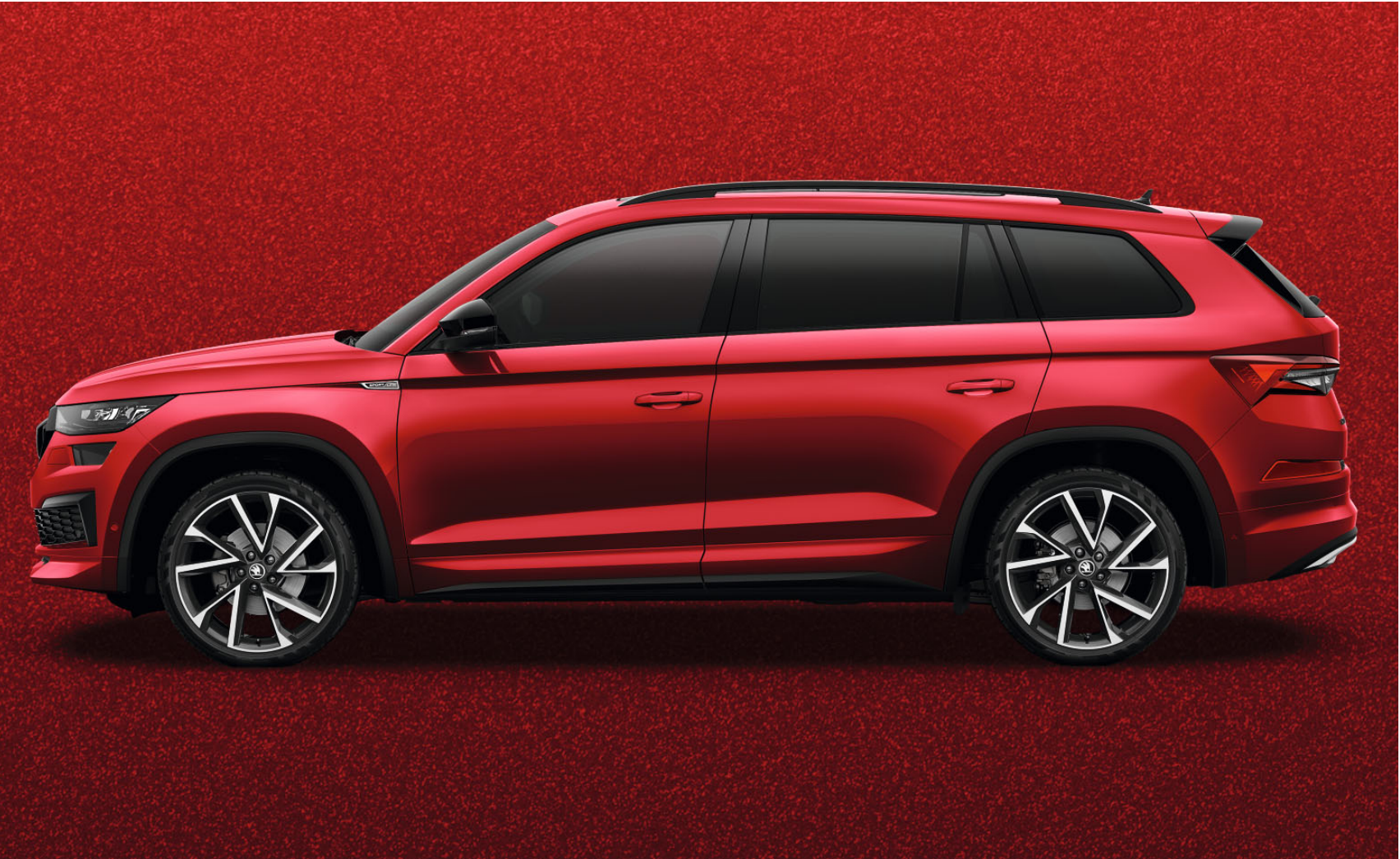
VELVET RED METALLIC