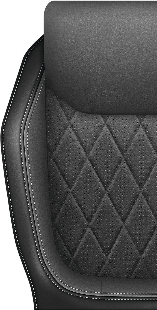
Black perforated Suedia/leather/leatherette upholstery with silver stitching