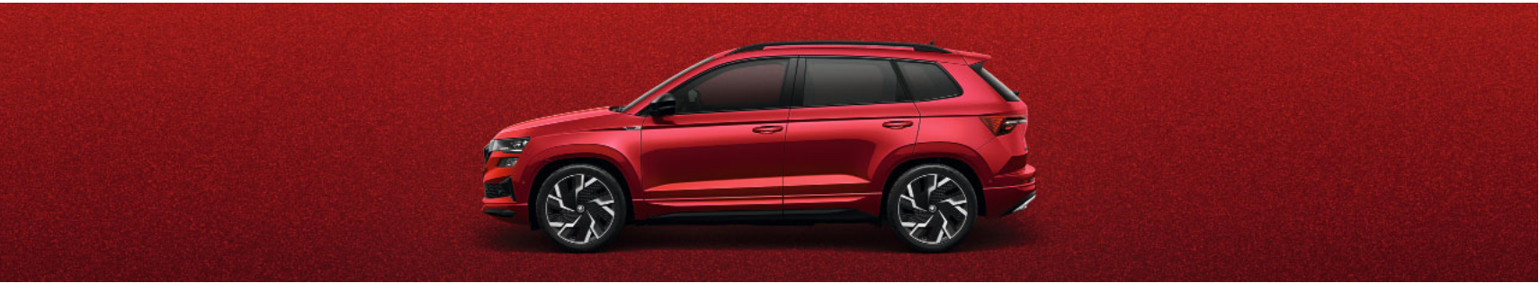
VELVET RED METALLIC