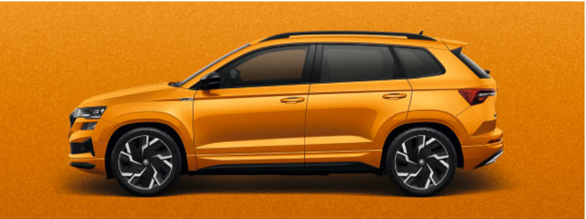
PHOENIX ORANGE METALLIC