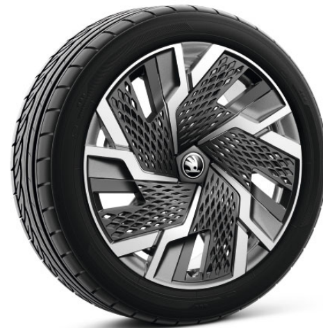
19" SAGITARIUS anthracite Aero alloy wheels with black covers