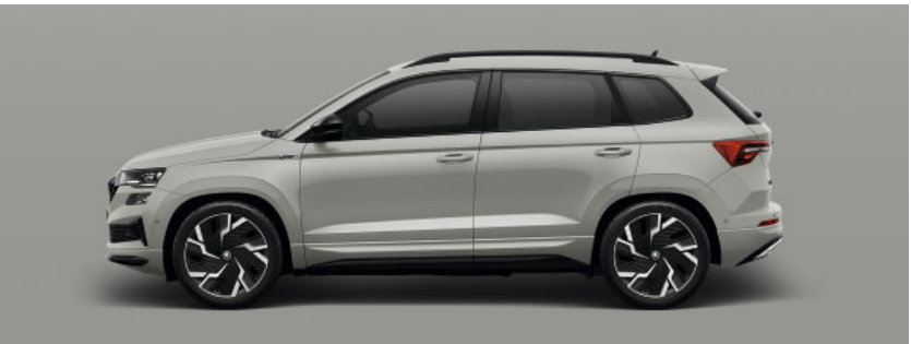
STEEL GREY UNI