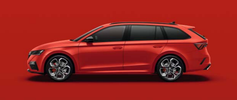
CORRIDA RED UNI