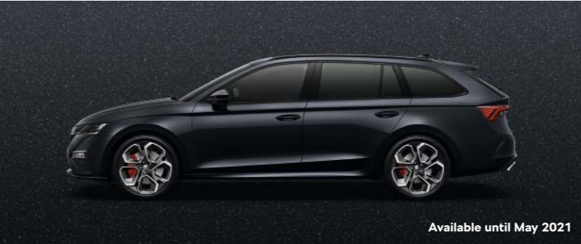
CRYSTAL BLACK METALLIC