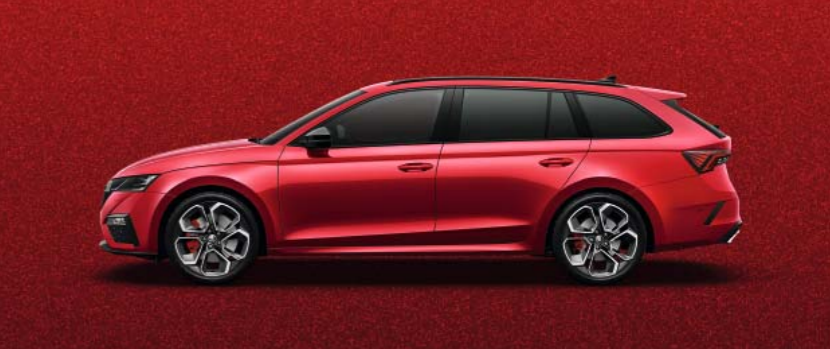
VELVET RED METALLIC