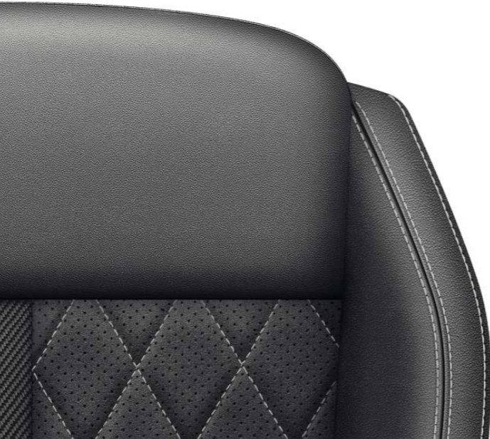
Black Alcantara®/leather/leatherette upholstery with grey stitching