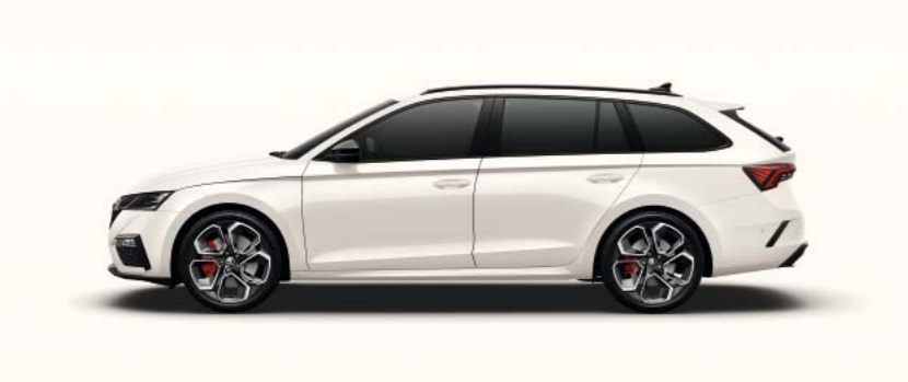
CANDY WHITE UNI