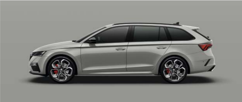
STEEL GREY UNI