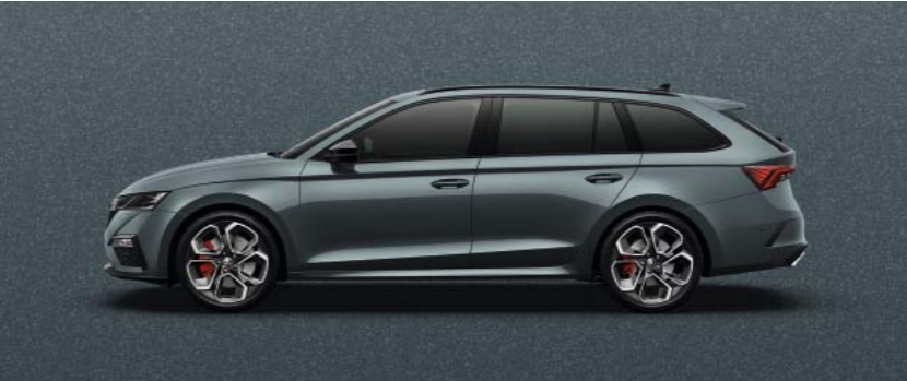
QUARTZ GREY METALLIC