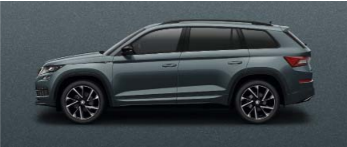
QUARTZ GREY METALLIC