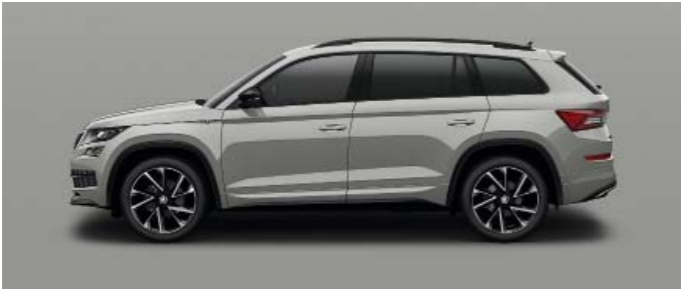
STEEL GREY UNI