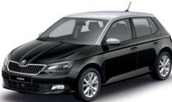
MAGIC BLACK METALLIC WITH SILVER COLOUR CONCEPT