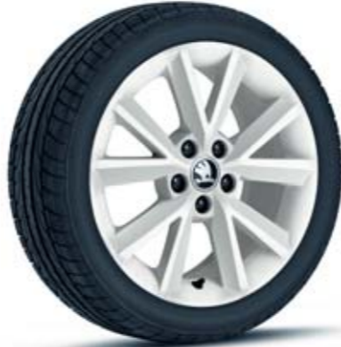
16" ANTIA white alloy wheels