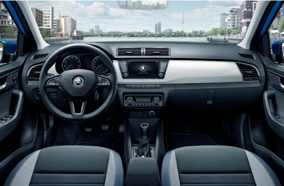
AMBITION BLUE INTERIOR Piano White décor

The Ambition version interior includes decorative chrome elements such as door handles, air-ventilation frames, instrument dial frames and steering wheel details. You can choose from a number of seat upholstery and décor colour combinations. The standard equipment covers electric front windows and height-adjustable driver seat.