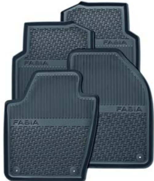
RUBBER MATS Easy-to-clean rubber foot mats protect the interior during inclement weather.