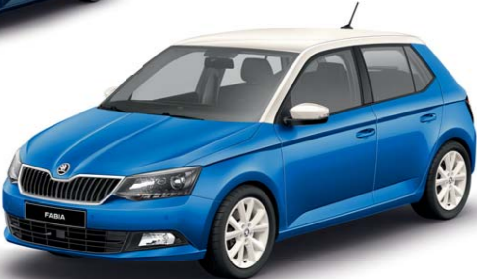
RACE BLUE METALLIC WITH WHITE COLOUR CONCEPT