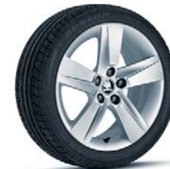
ROCK WHEEL 16" Rock alloy wheels.

Rear add-on part in textured black-grey, with integrated diffuser in reflective silver colour, gives the car rear an exceptionally robust appearance.