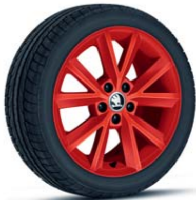
16" ANTIA red alloy wheels