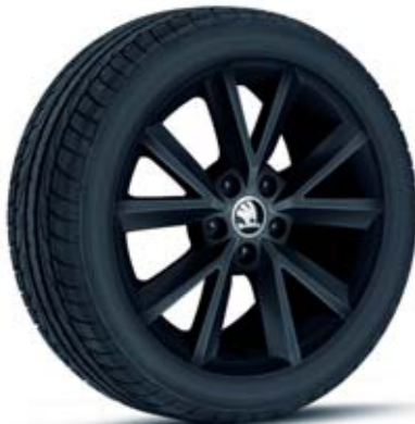
16" ANTIA black alloy wheels