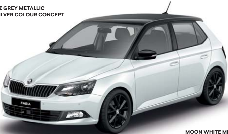
MOON WHITE METALLIC WITH BLACK COLOUR CONCEPT

The ColourConcept is exclusively designed for the hatchback version. For the complete list of colour combinations please visit our website.