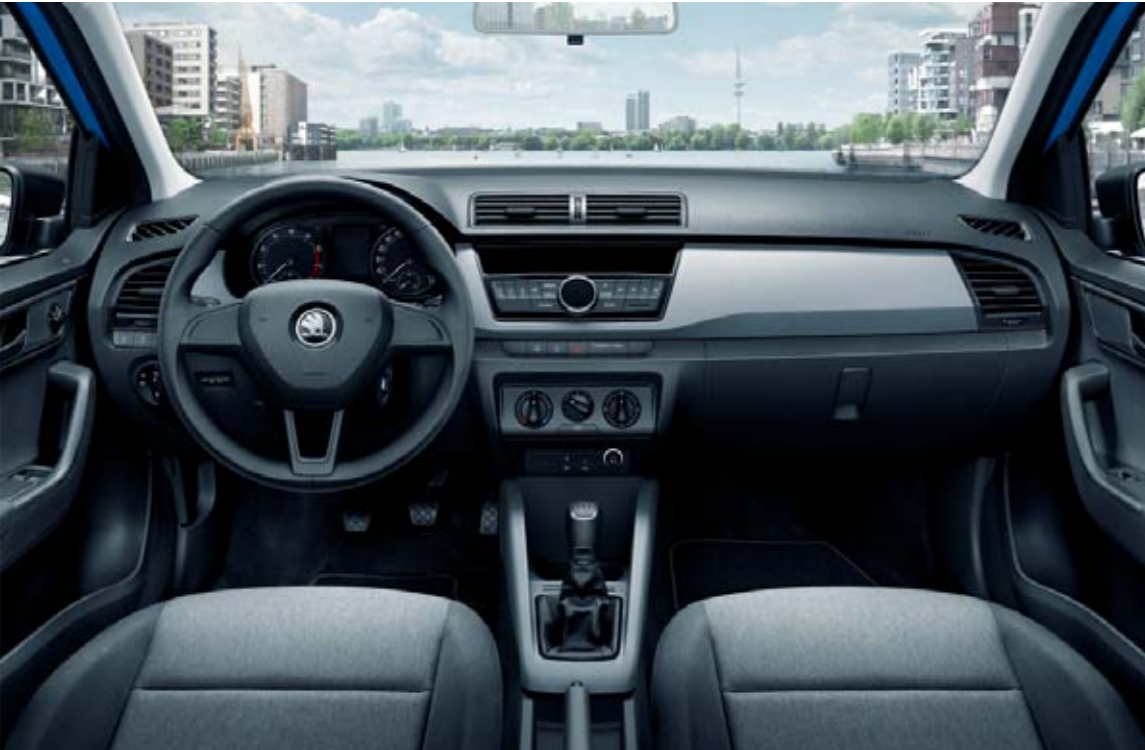
ACTIVE BLACK INTERIOR

The Active version interior includes black decorative elements, such as door handles, air-ventilation frames and instrument dial frames.