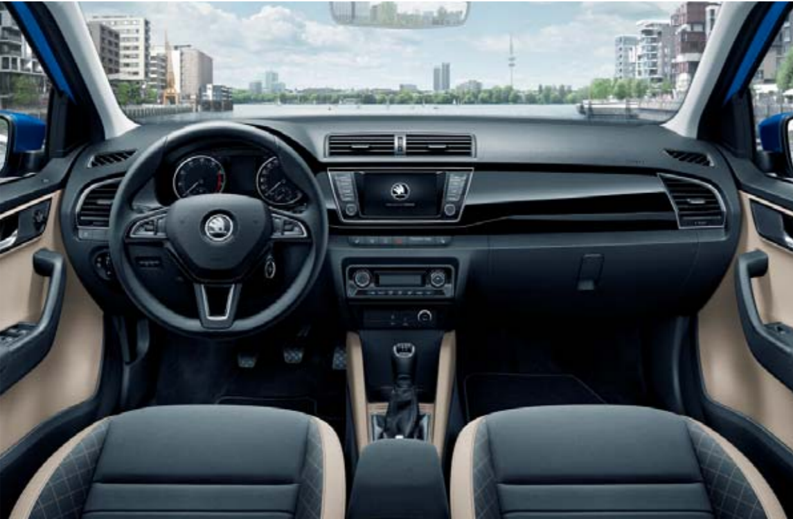
STYLE BEIGE INTERIOR Piano Black décor

The Style version interior also includes decorative chrome elements. You can choose from a number of seat upholstery and décor colour combinations. The standard equipment covers Easy Start, air-conditioning, Blues radio, height-adjustable driver and front passenger seats, leather steering wheel.