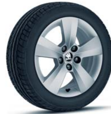
15" MATONE alloy wheels