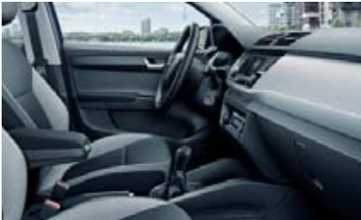
AMBITION GREY INTERIOR Light Brushed décor