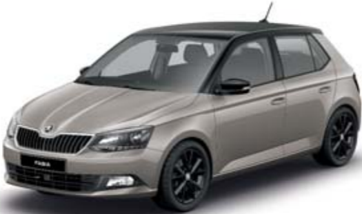
CAPPUCCINO BEIGE METALLIC WITH BLACK COLOUR CONCEPT