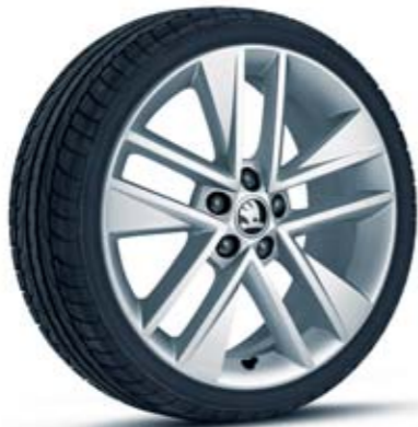
17" CLUBBER alloy wheels