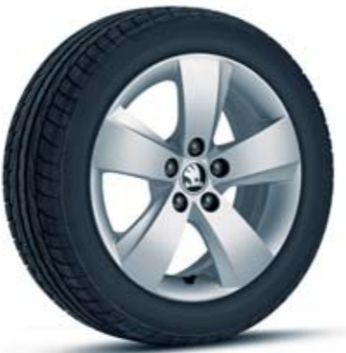
15" MATO alloy wheels