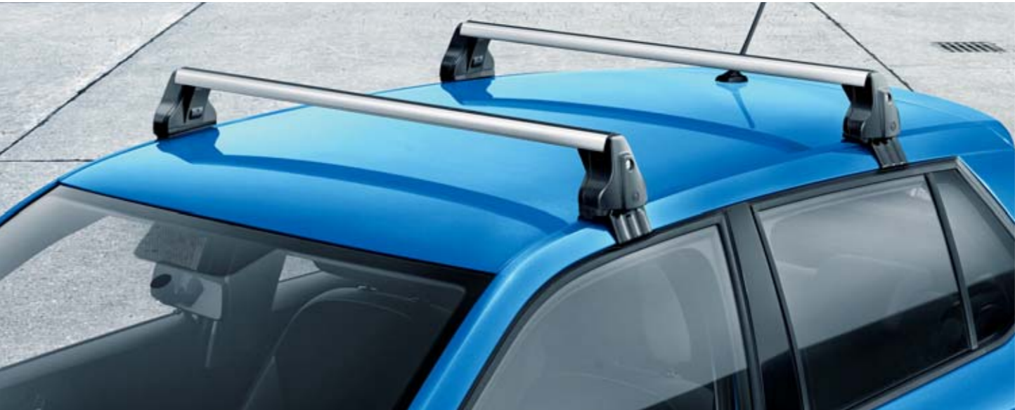
ROOF RACK You can securely attach racks and holders, such as a bicycle carrier or ski and snowboard box, onto the basic roof rack.