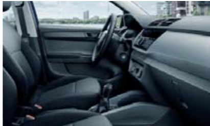
ACTIVE BLACK INTERIOR