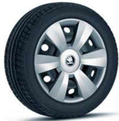
15" steel wheels with DENTRO hub covers