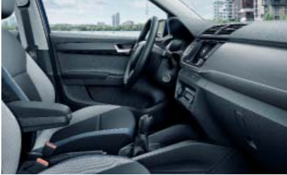
AMBITION BLUE INTERIOR Dark Brushed décor