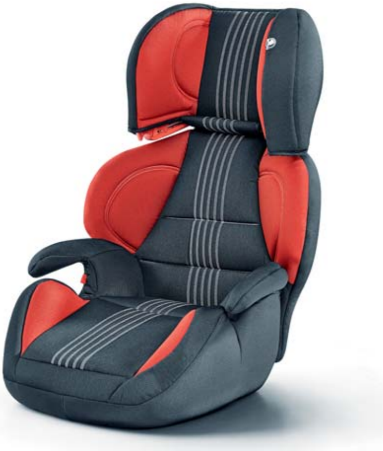
CHILD SEAT Safety and comfort of small passengers aged 3-12 (15-36 kg) is provided by the child seat Wavo 1-2-3, besides meeting the strict Euro NCAP safety standards.