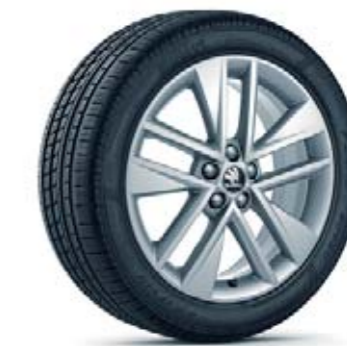
CLUBBER WHEEL 17" Clubber alloy wheels.