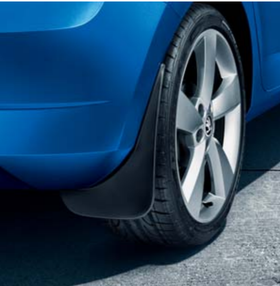
MUD FLAPS Rear mud flaps protect the chassis from mud and flying stones.