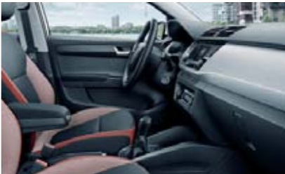
AMBITION RED INTERIOR Light Brushed décor