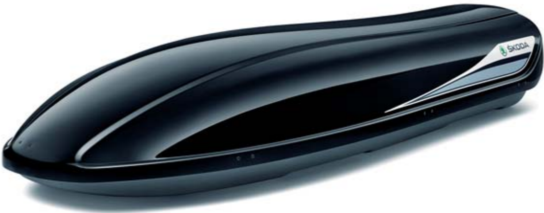
SKI AND SNOWBOARD BOX Lockable ski and snowboard box combines practicality, style and safety. It carries up to 5 pairs of skis or 4 snowboards.