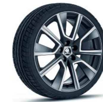
BRAGA WHEEL 17" Braga anthracite alloy wheels.