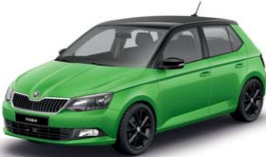
RALLYE GREEN METALLIC WITH BLACK COLOUR CONCEPT

The ColourConcept is exclusively designed for the hatchback version. For the complete list of colour combinations please visit our website.