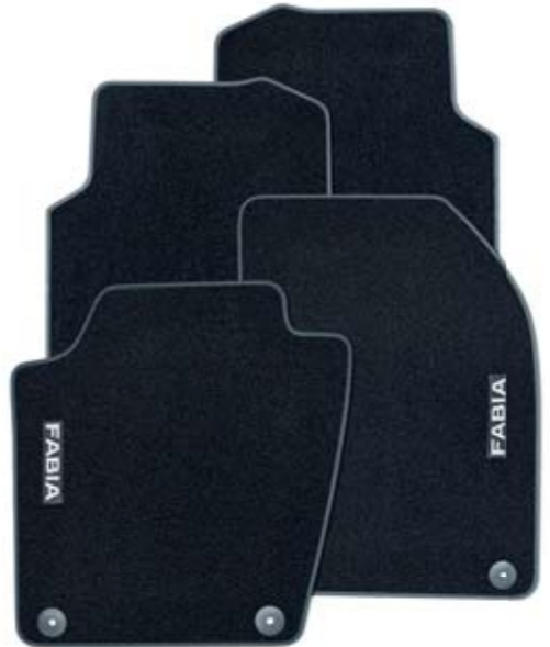
FOOT MATS High-quality textile foot mats make the interior more comfortable and cosy.