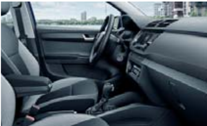
AMBITION GREY INTERIOR Basket Matt décor