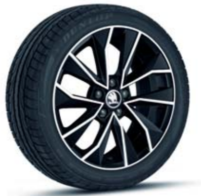
17" BRAGA anthracite alloy wheels*