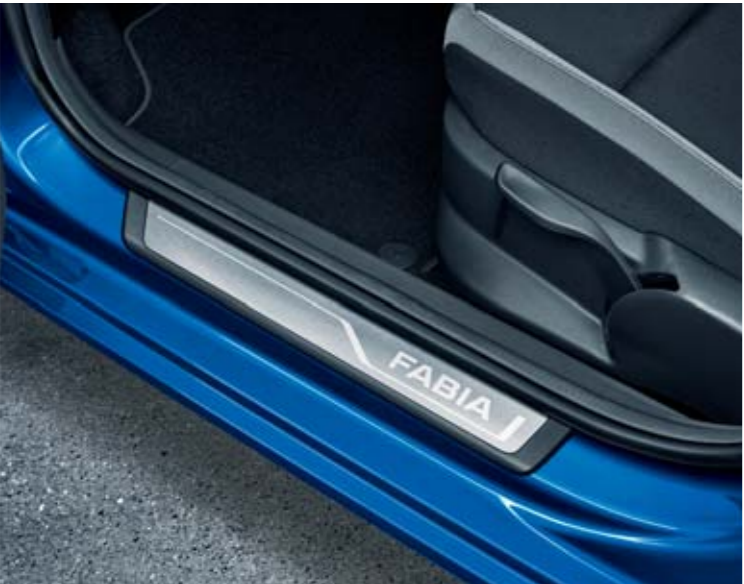
DOOR SILL COVERS Decorative door sill covers with aluminium inserts underline the car's unique design, besides protecting the door sills against mechanical damage.

Accessories aren't just fashion fads. With ŠKODA Original Accessories, you can transform your car by expanding its practicality, safety and purpose, and make it a lot more suitable for your specific needs.