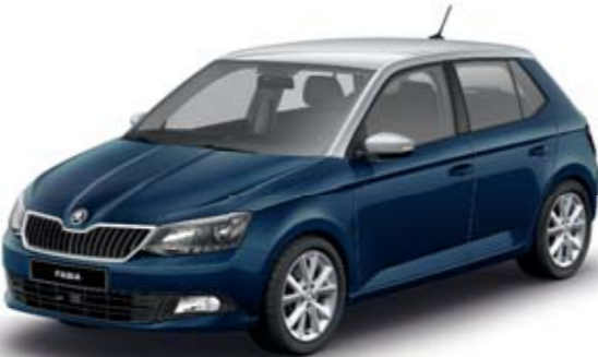
PACIFIC BLUE UNI WITH SILVER COLOUR CONCEPT