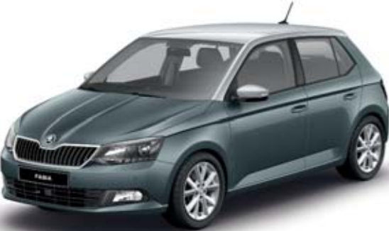
QUARTZ GREY METALLIC WITH SILVER COLOUR CONCEPT

You were born with a colour-muscle. Flex it. Designed exclusively for the hatchback version, ColourConcept offers many options to personalise your FABIA. Choose the roof, external side-view mirrors and wheels in white, silver or black and match them with a selection of colours for the main body.